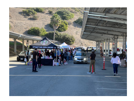
1000+ Families served in our multiple Distribution Events